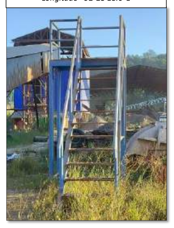
AAQMS No.-3 Location – Near View Point Latitude- 25°13'25.3"N Longitude- 92°23'03.3"E