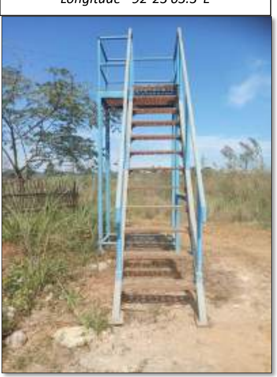
AAQMS No.-3 Location – Near View Point Latitude- 25°13'25.3"N Longitude- 92°23'03.3"E